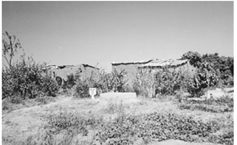
A typical compound