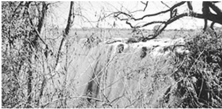
Victoria Falls, Livingstone, Zambia