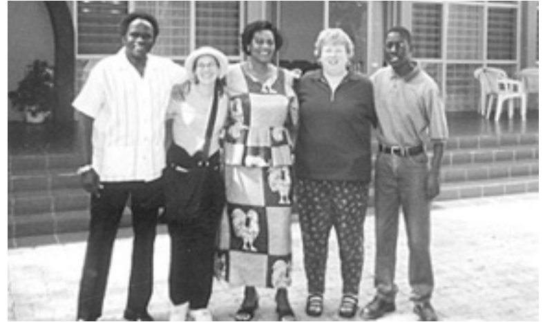
Zamcom Hostel with Friends