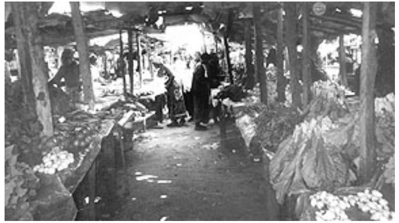
At the Market