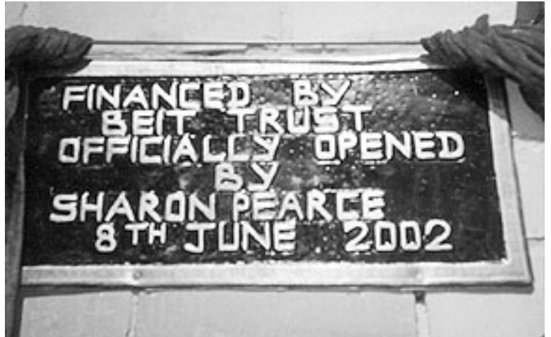
Plaque placed on Center wall at dedication